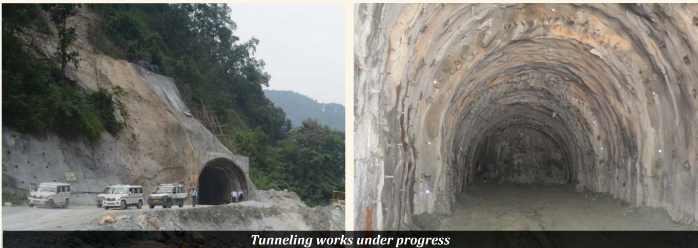
Tunneling works under progress