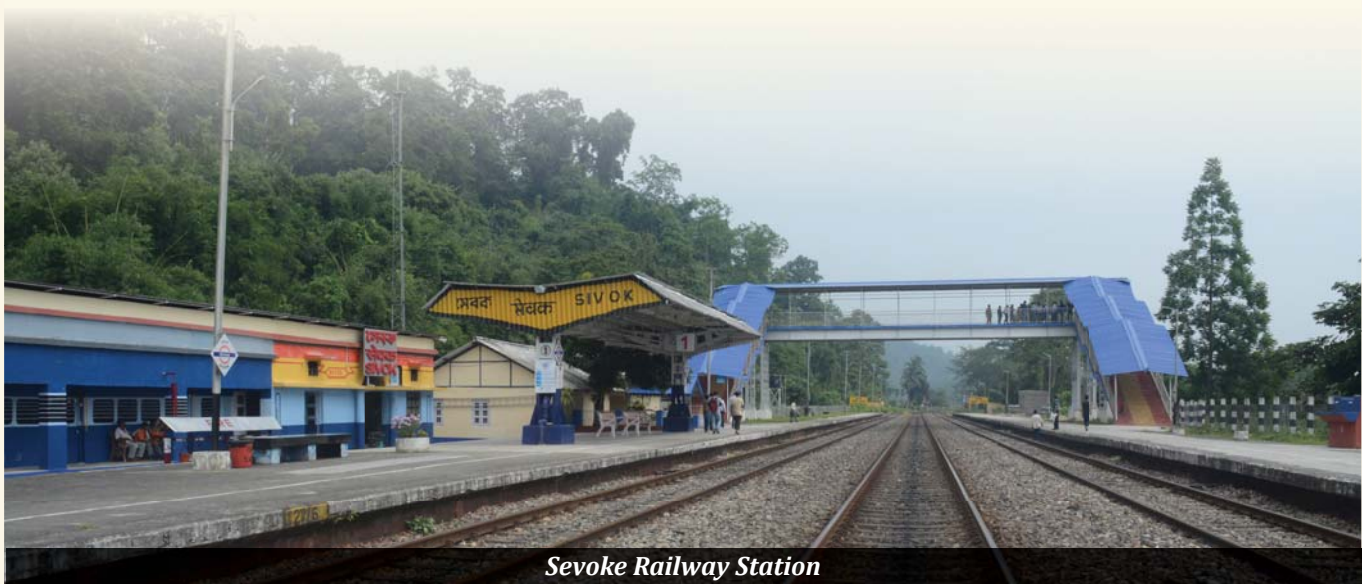
Sevoke Railway Station