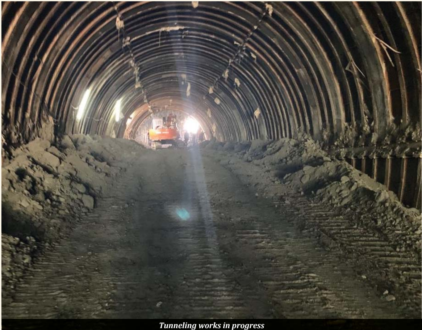
Tunneling works in progress