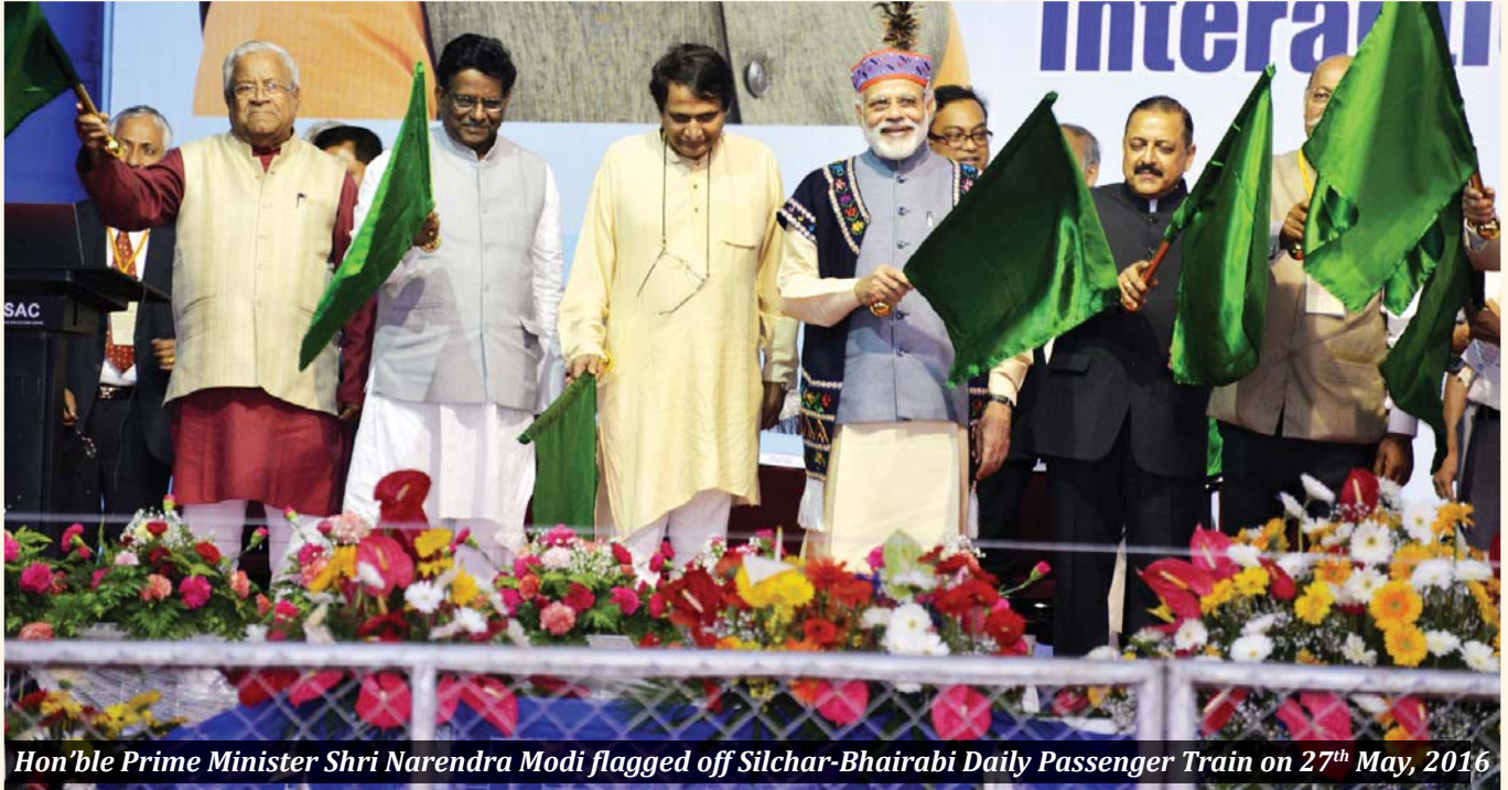
Hon'ble Prime Minister Shri Narendra Modi flagged off Silchar-Bhairabi Daily Passenger Train on 27 th May, 2016