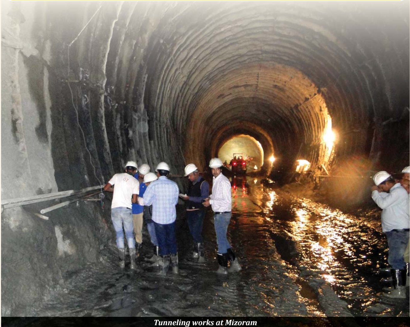
Tunneling works at Mizoram