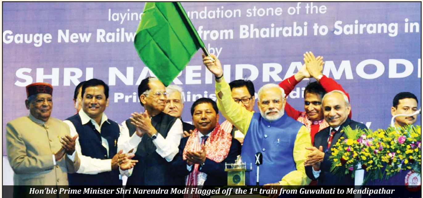
Hon'ble Prime Minister Shri Narendra Modi Flagged off the 1 st train from Guwahati to Mendipathar