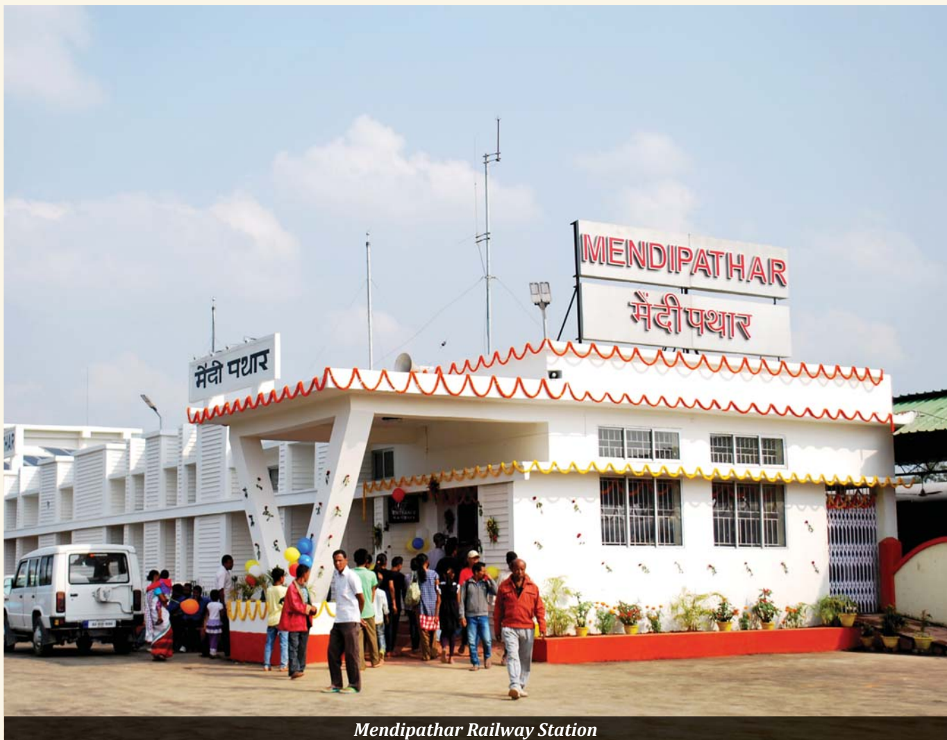
Mendipathar Railway Station