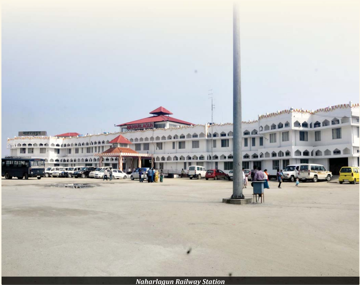
Naharlagun Railway Station