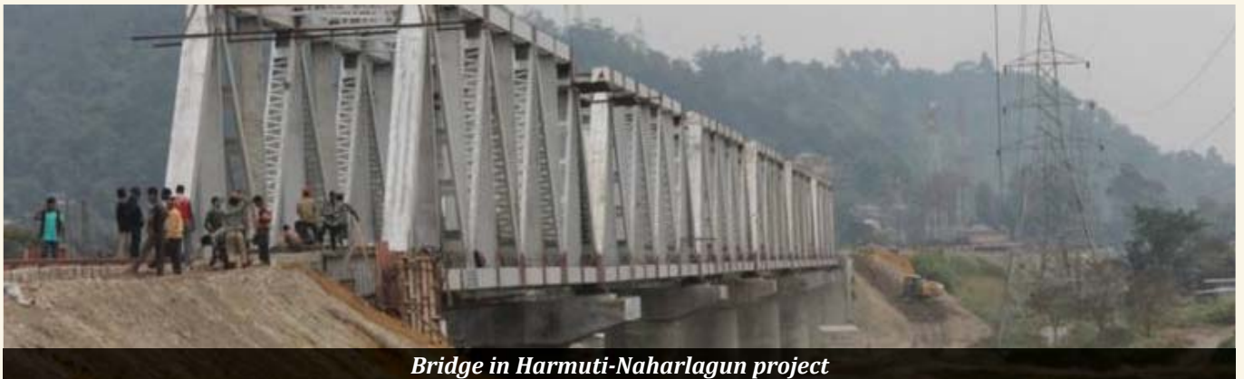
Bridge in Harmuti-Naharlagun project