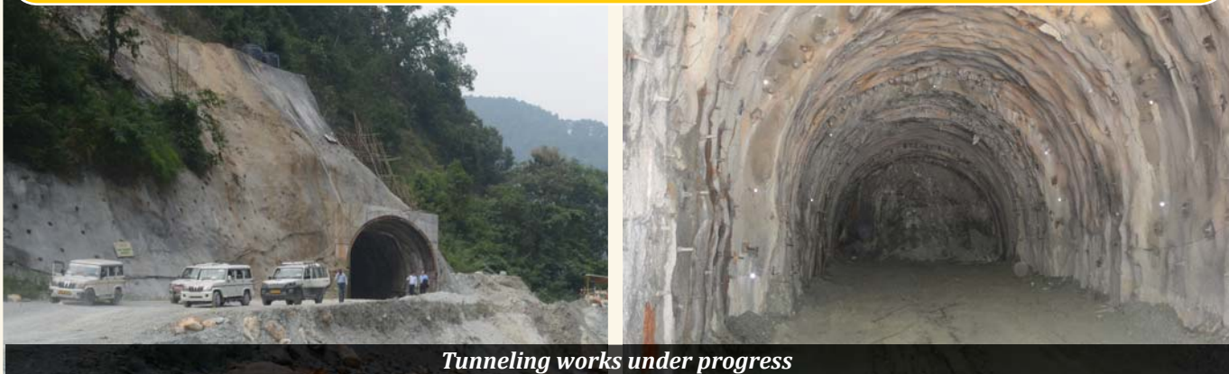
Tunneling works under progress