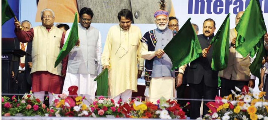
Hon'ble Prime Minister Shri Narendra Modi flagged off Silchar-Bhairabi Daily Passenger Train on 27 th May, 2016