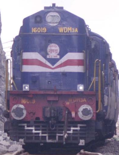
Dudhnoi-Mendipathar new line project