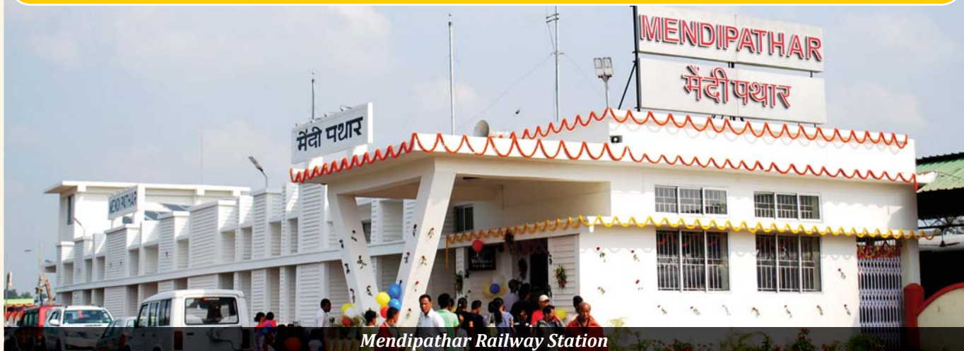
Mendipathar Railway Station