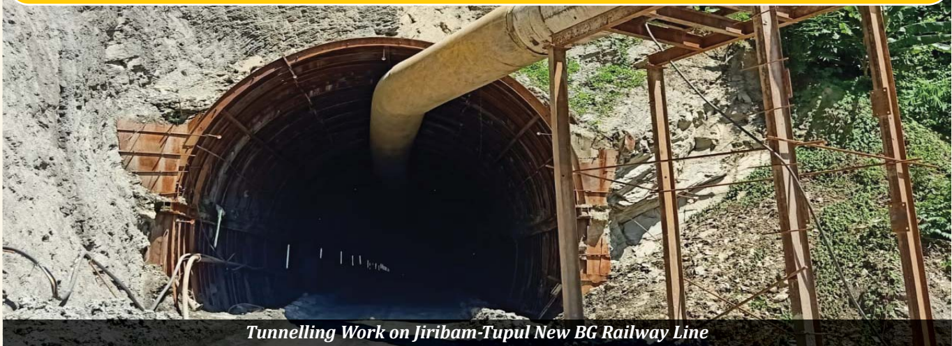
Tunnelling Work on Jiribam-Tupul New BG Railway Line