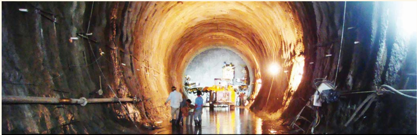
Tunnelling Work on Jiribam-Tupul New BG Railway Line