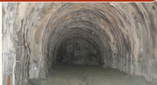
Tunneling works under progress