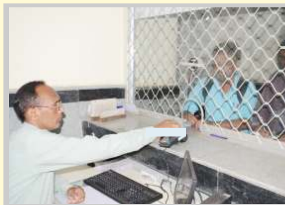
Issue of Ticket through PoS machine at Puri Railway Station