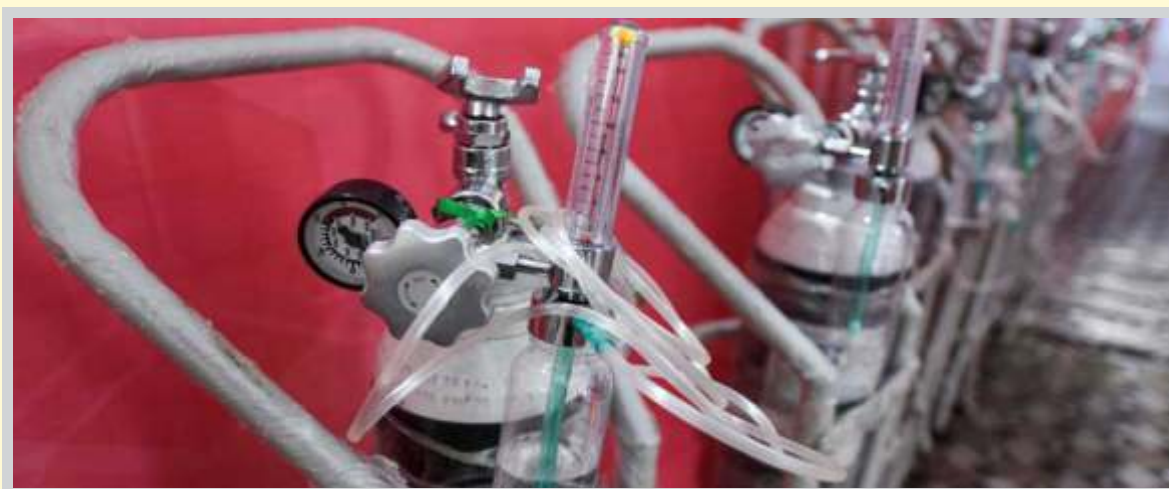
Oxygen plant installed at Railway Hospital, Mancheswar