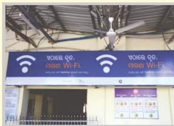
Use of Free Wi-Fi facility at Sakhigopal Railway Station