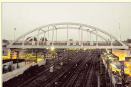
Road Over Bridge at Jatni