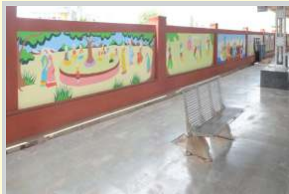
Brahmapur Railway Station