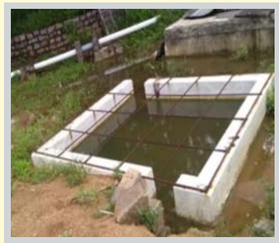
Rain Water harvesting plant at Barpali Station