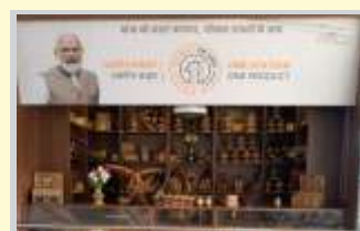
Kesinga Railway Station