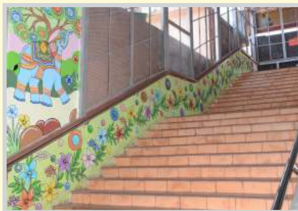
Visakhapatnam Railway Station