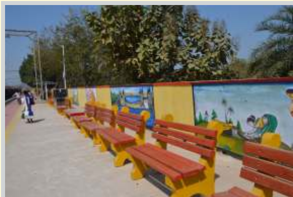
Rairakhol Railway Station