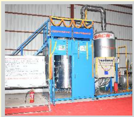
Waste to Energy Plant at Carriage Repair Workshop, Mancheswar