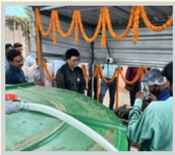
Inauguration of Bio-gas plant at Running Room RGDA