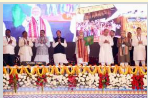
Flagging off of PURI-SONEPUR Weekly Express

Hon'ble PM flagged off new passenger train between Sonepur and Puri and dedicated to the nation SBP-TLHR doubling project, Banspani- Daitari- Tomka-Jakhapura doubling work, Jhartarbha to Sonepur new railway line and other railway projects in a function held at Sambalpur.