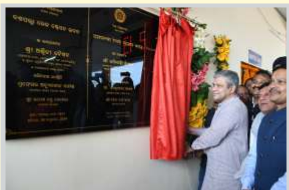
Hon'ble MR inaugurated Daspalla railway station and flagged off the MEMU train between Daspalla and Puri.

Hon'ble PM Flagged off Puri- Howrah Vande Bharat Express through video conference. On this occasion Hon'ble MR Shri Ashwini Vaishnaw and Hon'ble Union Minister Shri Dharmendra Pradhan were present at Puri railway station.