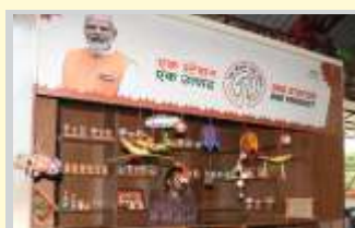
Puri Railway Station