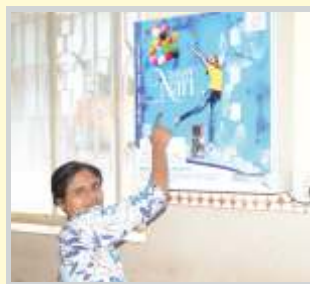
Sanitary Pad Vending Machine