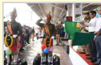
RPF personnel monitoring CCTV footage and Segway Patrolling System