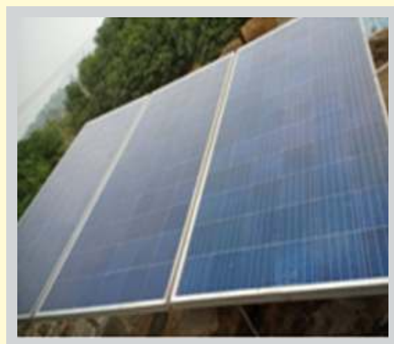
Solar Plant at Barpali Station