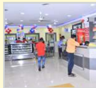
Eat Right Station-Bhubaneswar