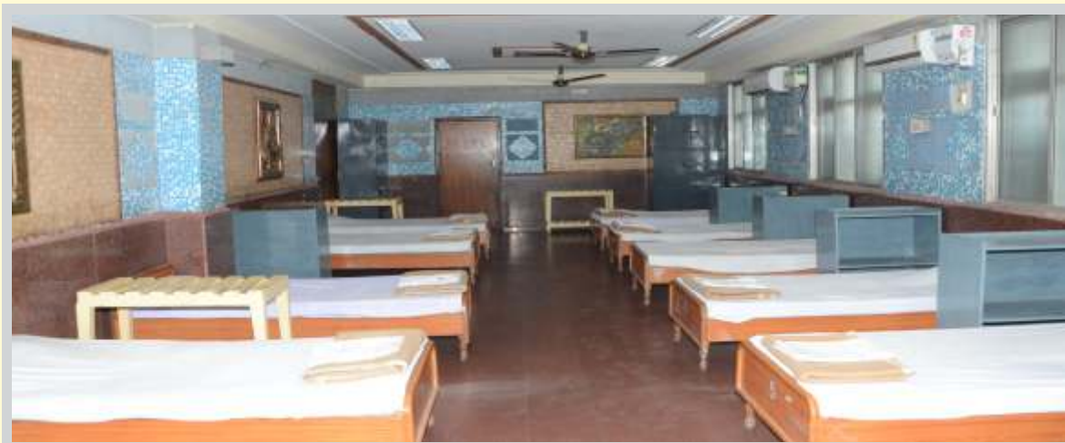
AC Dormitory at Bhubaneswar Station