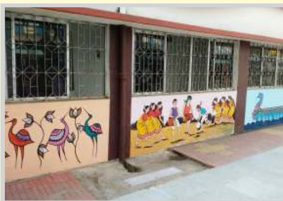
Jharsuguda Railway Station