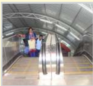
Escalator at Cuttack Station