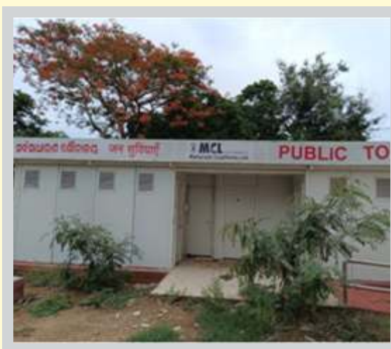
Public use Toilets (CSR) Constructed at KIT Station