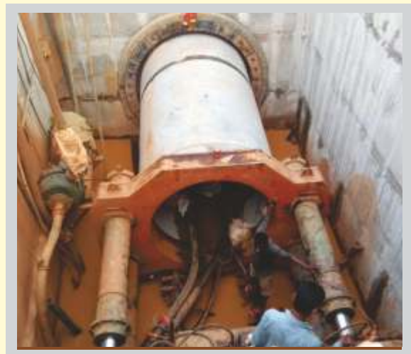
Micro-Tunnelling process in progress at Bhubaneswar Station