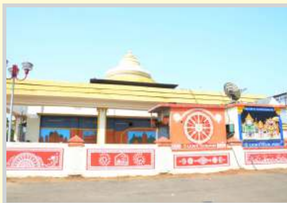
Puri Railway Station