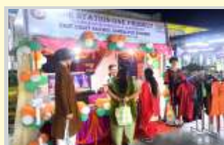
Sambalpur Railway Station