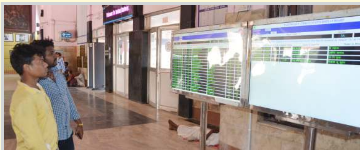
Electronic Chart Display Board at Cuttack Railway Station