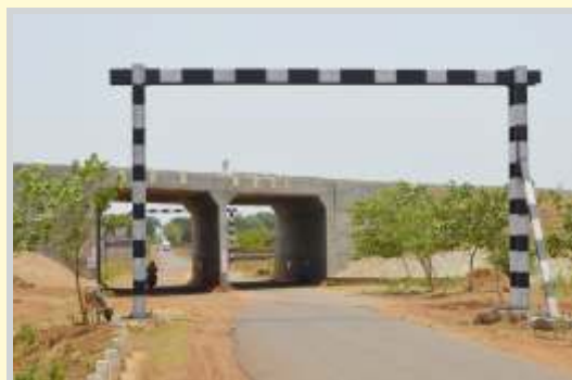
Road Under Bridge near Khurda Town Station