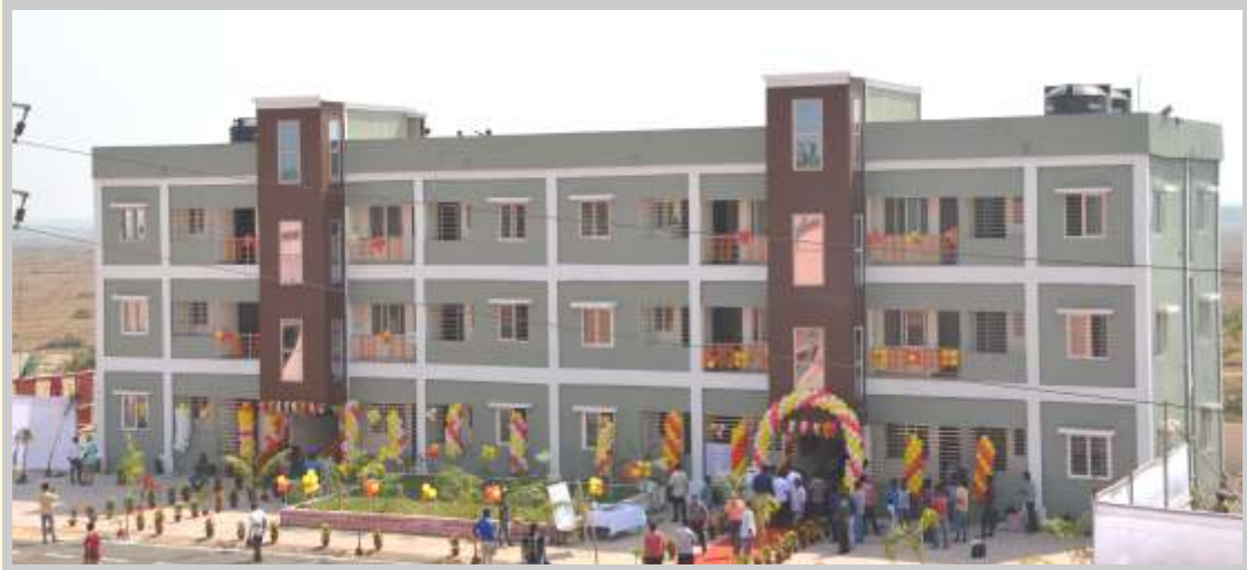
Pre-Fabricated Residential Building at Jakhapura