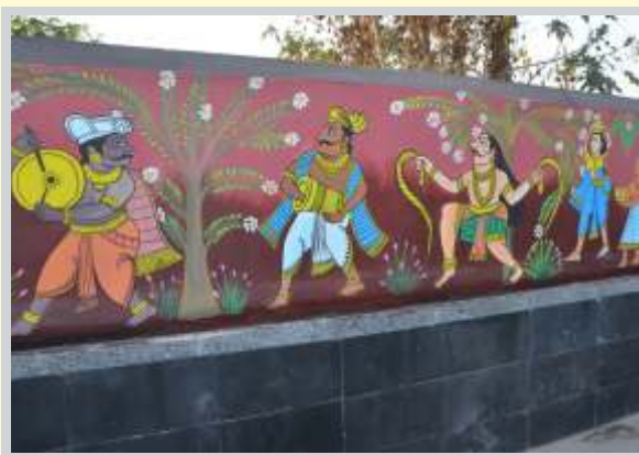
Cuttack Railway Station