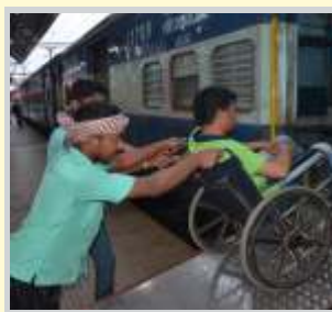
Portable Wheel Chair Ramp at Bhubaneswar