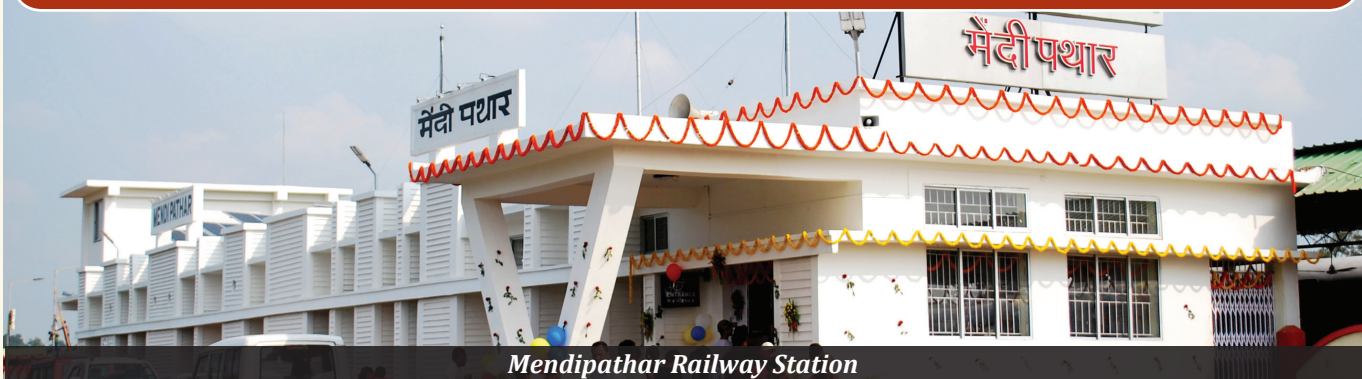
Mendipathar Railway Station