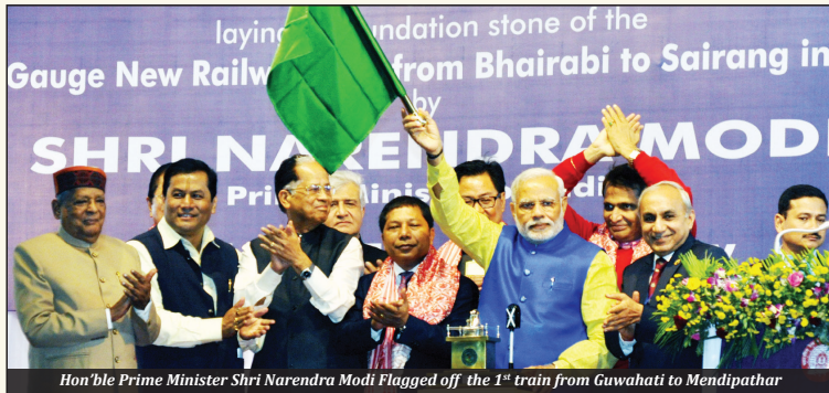
Hon'ble Prime Minister Shri Narendra Modi Flagged off the 1 st train from Guwahati to Mendipathar

➔ Meghalaya entered the railway map of India, when Hon'ble Prime Minister Shri Narendra Modi flagged off the first passenger train from Guwahati (Assam) to Mendipathar (Meghalaya) on 29 th November, 2014