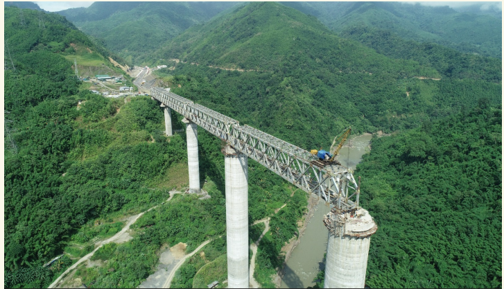
Under Construction Noney Bridge