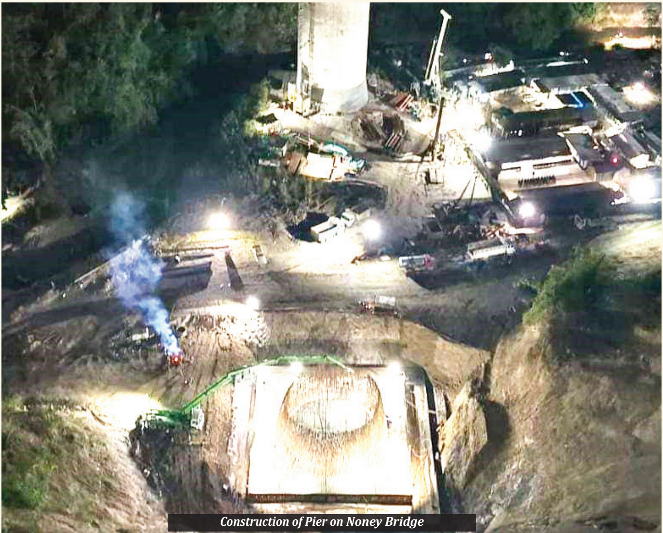
Construction of Pier on Noney Bridge