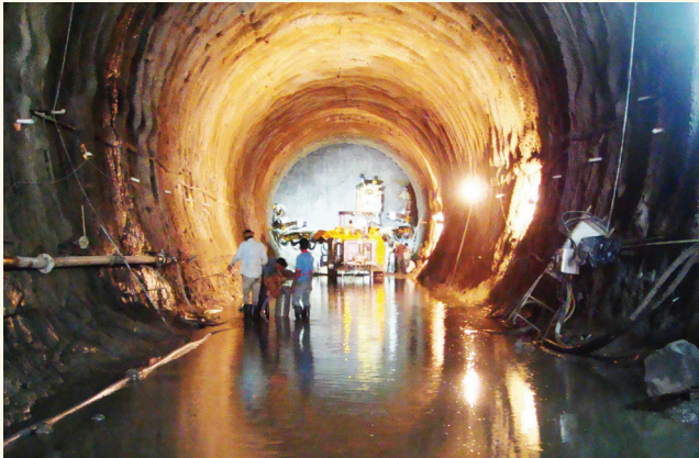
Tunnelling Work on Jiribam-Tupul New BG Railway Line